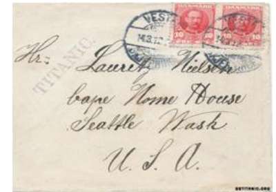
SSTitanic.org Cover (16)