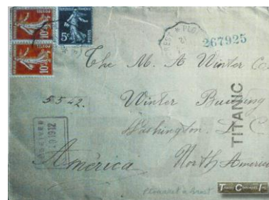
Little Titanic Museum (08)