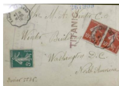
Titanic Museum (11)