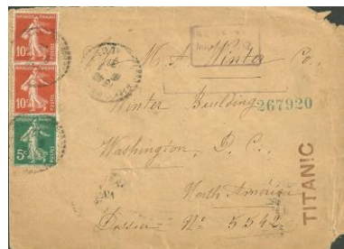
Eric of New Jersey (10)