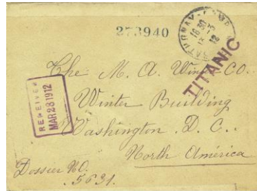
Foster Cover (14) (25 centimes stamp on reverse)