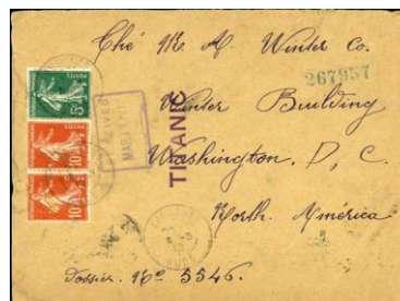
The Mystery Box (03)