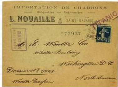
Early American History Auctions (13)