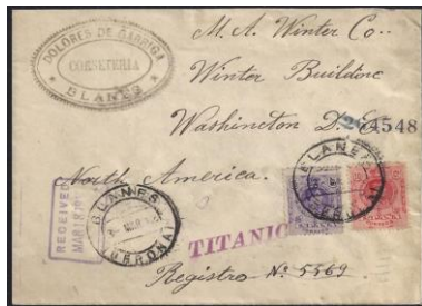
Santa Cruz (21)