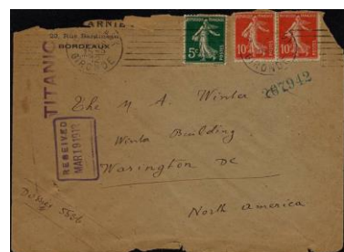
Sandafayre's 2001 (9)