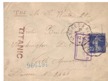
Spink 2012 (04)