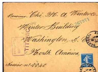
Sandafayre's Hunters 2005 (05)