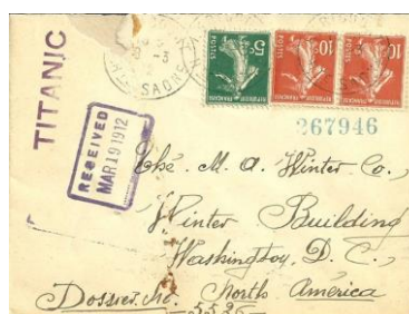
Eric of New Jersey (07)