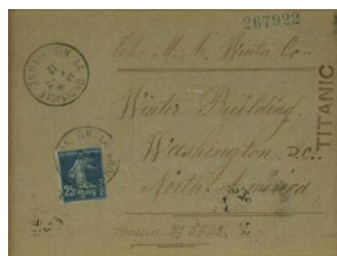
Jay Baum (06)